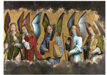
SUNG VESPERS PRESENTED BY ST. BENEDICT & ST. ANDREW PARISHES Sunday, February 20th at 7:30pm

Join us on Sunday, February 20, 2022 at 7:30pm when we will join together with Saint Benedict parish for sung vespers in the main church at Saint Benedict, 2215 W. Irving Park Rd. This sung prayer experience will invite you into the sacred tradition of the church with a beautiful candle lighting ritual. All are invited to come attend and enter into the beauty of music in prayer that is part of our Catholic tradition.