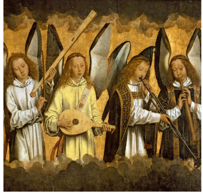
SUNG VESPERS PRESENTED BY ST. BENEDICT & ST. ANDREW PARISHES

After the service, there will be a reception with wine and refreshments.