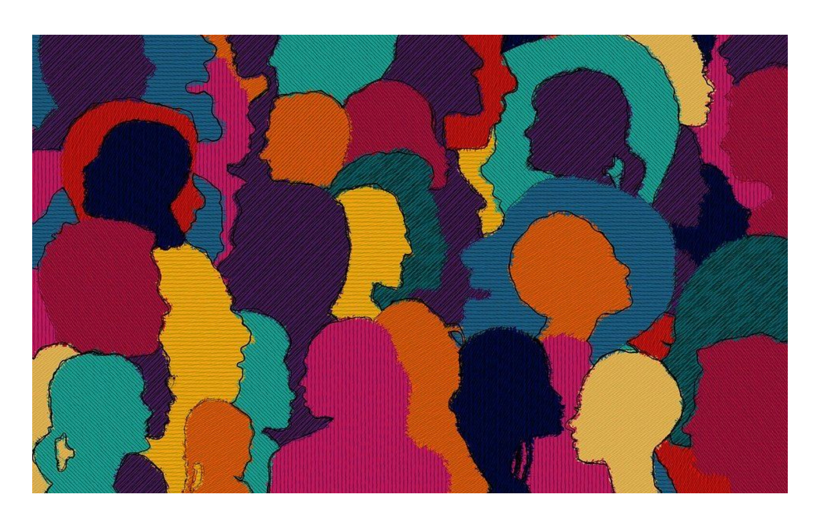
"There are different kinds of spiritual gifts but the same Spirit." 1 Corinthians 12:4