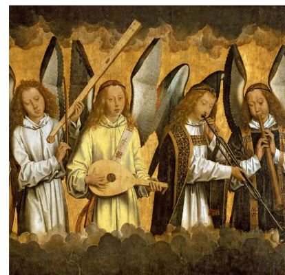
SUNG VESPERS PRESENTED BY ST. BENEDICT & ST. ANDREW PARISHES

The Sacrament of Reconciliation is available on Saturdays at 3:00pm in the main church.