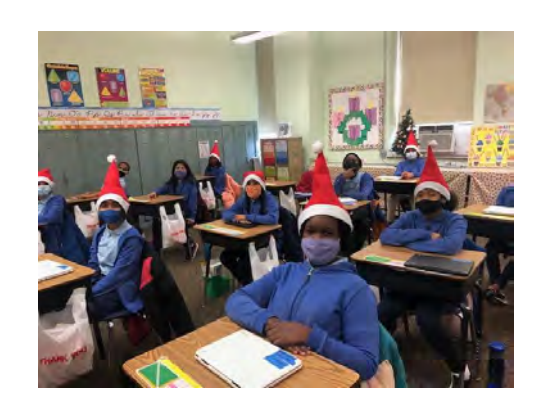
5525 N. Magnolia