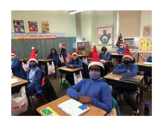
5525 N. Magnolia