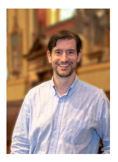
"I hope you have at least one friend with whom you disagree."

I hope you have at least one friend with whom you disagree.