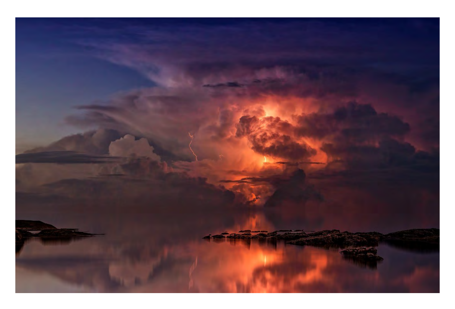
"And then they will see 'the Son of Man coming in the clouds' with great power and glory." Mark 13:26