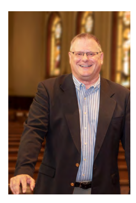
"Gratitude opens us up to the grace of God."